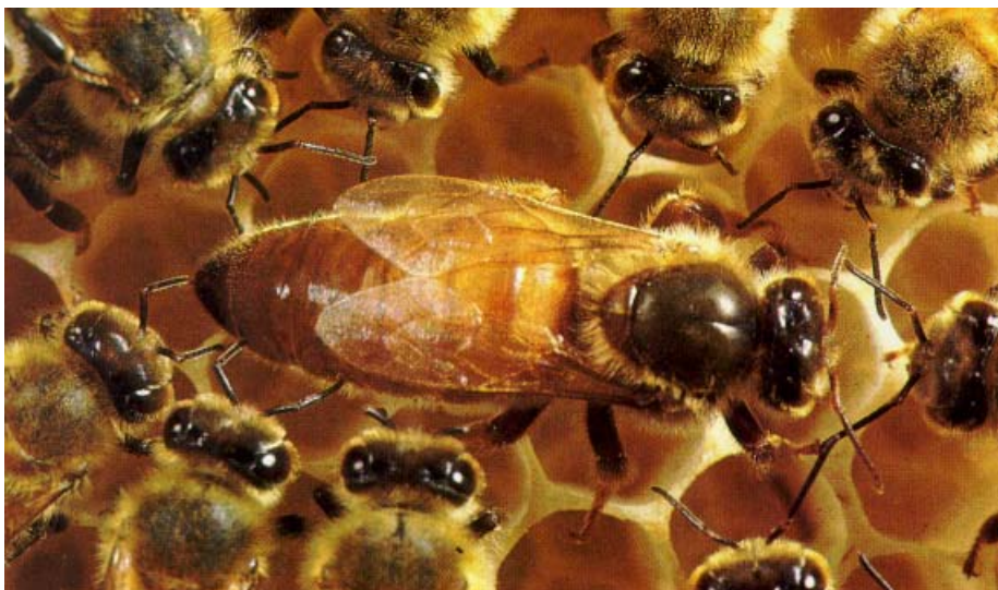
The queen bee is groomed by her attendants.