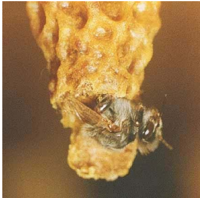
Queen bee emerging from a queen cell

Of course, you may prefer to raise your own replacement queens. This unit of competency does not cover raising queen bees but the majority of the unit is relevant whether you have raised your own queens or have purchased them from a supplier. If you are interested in rearing your own queens, then you should undertake the unit RTE3156A Rear queen bees.